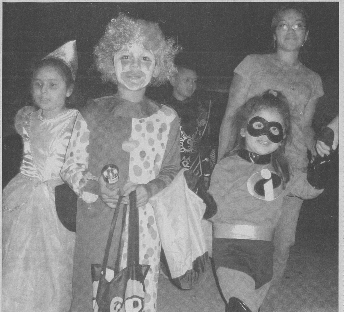
Pictured above are some trick or treaters out looking for goodies on Halloween night.